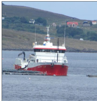
Viktoria Viking transferring 2.5 kg. Stock to Ardesseie pens in Little Loch Broom.

Once again the able crew on the Viktoria Viking handled our valuable growing stock with care and successfully delivered 4 loads to Ardesseie , sites A and B