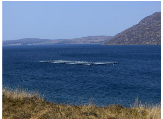
Ardessie pen groups on south side of Little Loch Broom.

site, and stock will be harvested in the period July 2011 – February 2012.